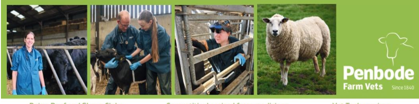
Dairy, Beef and Sheep Clubs Data Analysis